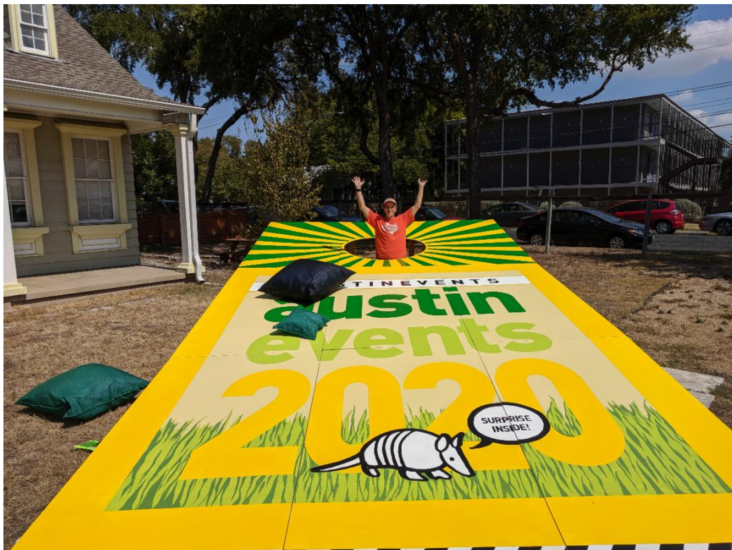
A happy cornhole player at Vida Pura Juicery

Can't make it but want to see SUPER GIANT CORNHOLE? Stay tuned! I've got some other places in the works!