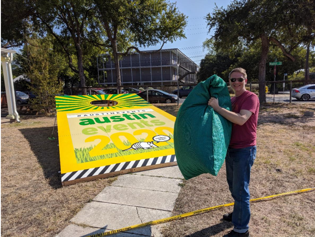
A player gets ready to through the cornhole bag.